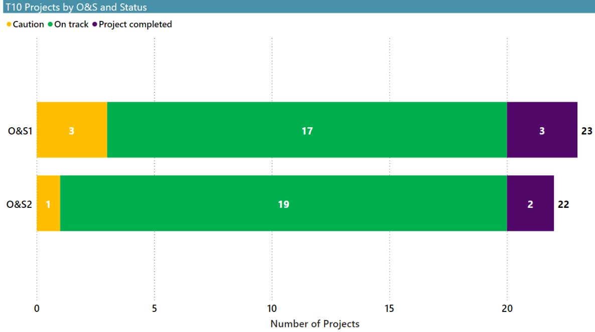
Figure 2 – Projects by Status (Quarter 4)

Details of the programmes, projects and performance indicators with a concern or caution status together with an explanation of their performance and improvement plan can be found in Appendix 1